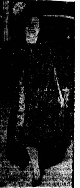
DR. CHARLOTTE WHITTON LONDON — (CP) — Average age at a Hackney old age pensioners party was 67.